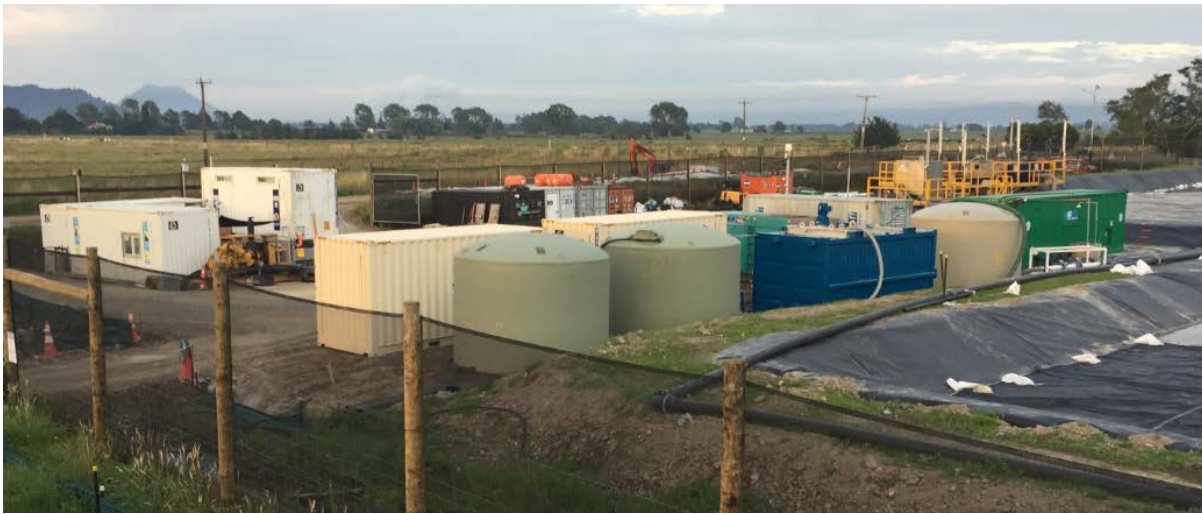
Figure 8: Water treatment plant with outflow to geobags in Containment Site 1

The revised method used a single cutter suction dredge (Figure 3) and transfer pump to pump the dredge slurry from the canal through a pipeline to the containment sites where it was treated and dewatered (Figure 8). In addition to this transfer process reducing the potential for spillage, it eliminated the need for heavy equipment to be operated on the roads and the edges of the canal. While the exact reduction in energy use to complete the project was not calculated there can be no doubt that a significant reduction of energy use and emissions was achieved through this change in method.