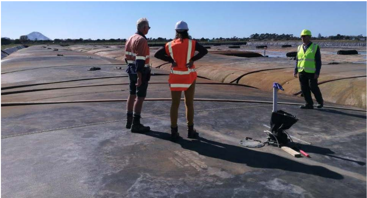
Figure 9: Geobags being inspected at Containment Site 1