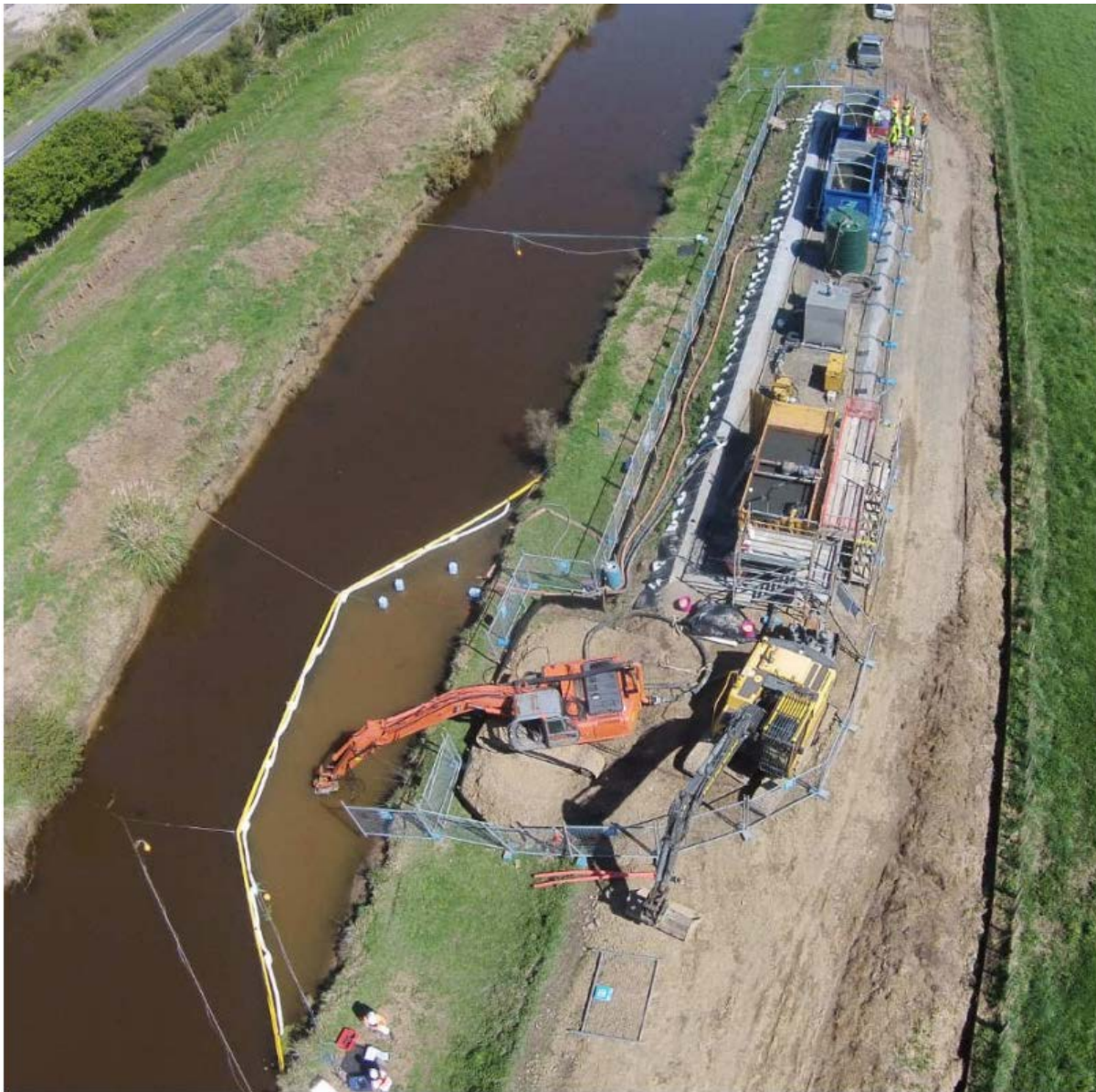
Figure 6: Dredging trial

Following the approval of the consent, variations works were tendered and commenced in early 2017. While the initial evaluation process carried out in 2006 may have been considered best practice the evaluation was not supported by a detailed analysis of stakeholder or community member views.