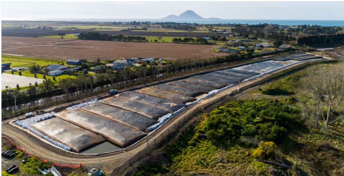
Figure 2: Second containment site (Containment Site 3)