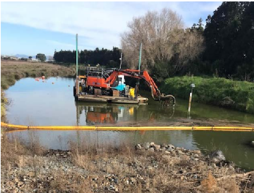
Figure 4: Completion of dredging at end of 5.1km stretch of dredging