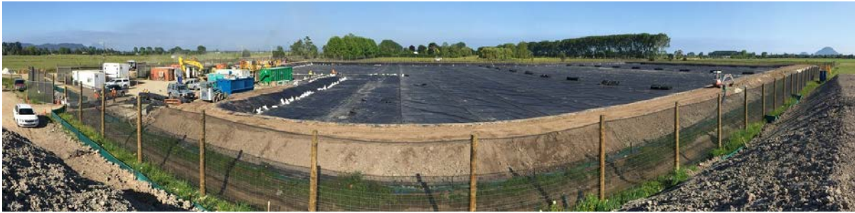
Figure 1: First containment site (Containment Site 1)

Actual remediation works commenced in early 2017 with construction of the first of two purpose-built containment sites (Figures 1 and 2). Civil construction works were delayed in April 2017 due to Cyclone Debbie and recommenced in October 2017. Dredging commenced in January 2018 (Figure 3) and final dredging and canal validation was completed in July 2019 (Figure 4).