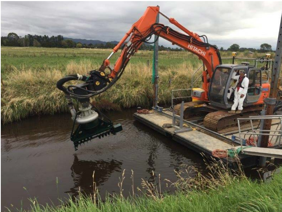
Figure 3: Start of dredging with cutter suction and pumped transfer methodology